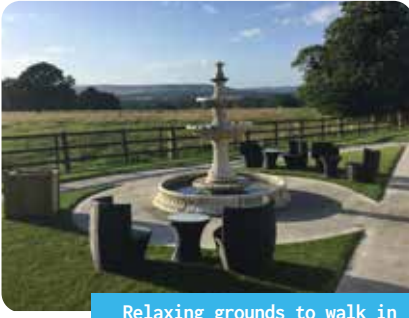
Relaxing grounds to walk in