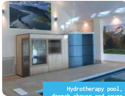
Hydrotherapy pool, drench shower and sauna