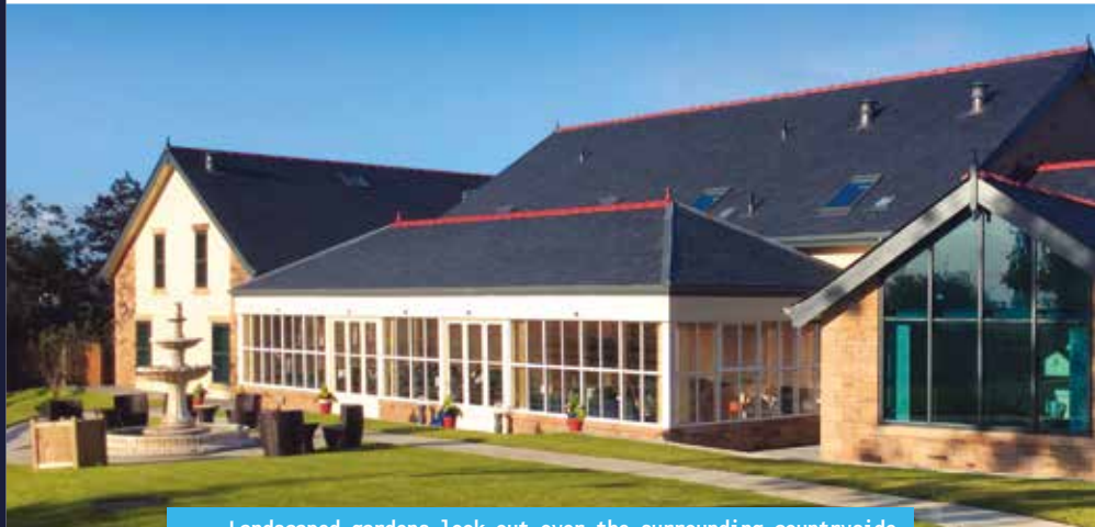
Landscaped gardens look out over the surrounding countryside